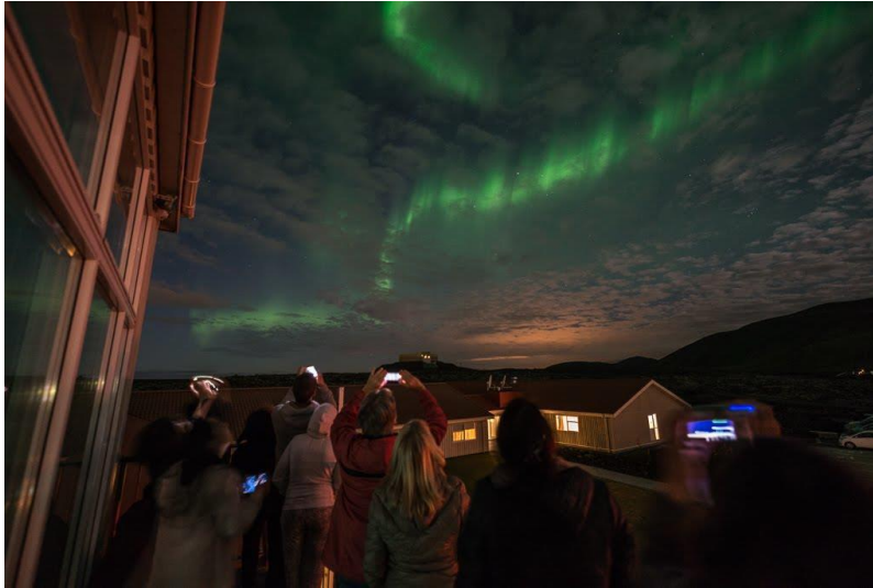
Outside the Northern Light Inn

Watching the fantastic colours of the Northern Lights dance across the arctic sky is an unforgettable experience, and Iceland is one of the best places to see them. They are mostly observed on crisp, still evenings, and your location well away from the city lights gives you the best chance of witnessing this spectacular natural phenomenon. You will simply need to step outside of the hotel and look up into the sky. We can provide no guarantee, of course, as the aurora borealis is a natural phenomenon – it can be fickle and a bit unpredictable – but we have seen it on all five previous trips S&T and Spears Travel have taken to Iceland.