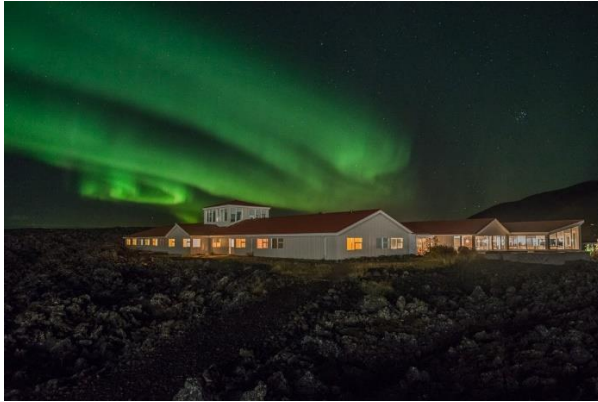
Outside the Northern Light Inn

This evening you'll enjoy a group dinner at the hotel followed by an astronomy lecture in the restaurant. Afterwards have a look outside to see if the northern lights are on display.