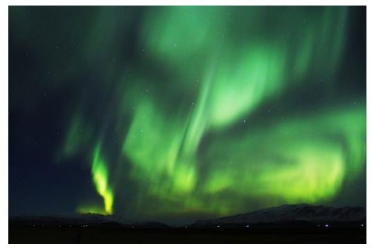
crispy cold and very still evenings.

You will be met this morning by an Iceland Travel tour guide and taken to a local restaurant, Vitinn, for breakfast . Then, it's on to the Blue Lagoon for a soak in the relaxing, restorative aquamarine waters. This morning enjoy a visit to the famous Blue Lagoon. The Lagoon is a unique wonder of nature, a lagoon with pleasantly warm mineral-rich geothermal water in the middle of a black lava field. The high natural levels of silica and minerals give the Lagoon its rich blue color. A visit to the Blue Lagoon is both invigorating and exciting, whether one bathes there surrounded by snow in the middle of the winter or in the long summer daylight. You will be transferred to your hotel, the Northern Light Inn, just a few minutes up the road from the Blue Lagoon. Check-in, settle into your rooms, and have a short rest before enjoying a group dinner in the cozy restaurant. (Lunch on your own)